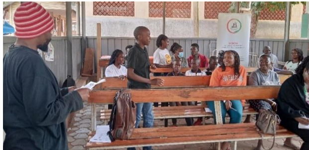
Youth Dialogue in Kawempe Division

and Division Integrated Adolescent & Youth Committee members.