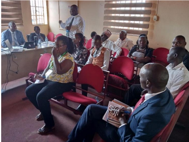
The Coordinator of the Public Sector at UAC, presenting at the DAC in Kawempe Division