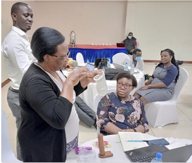
Female condom demonstration by an MoH official