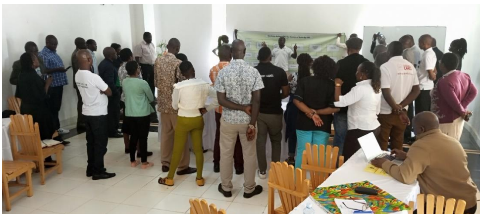
YES Team leaders presenting the Community Flow of condoms to the last user

AMICAALL in partnership with UNFPA and funding support from the UNAIDS Technical Support Mechanism organized and conducted a country-to-country learning mission. The aim was to learn about the Uganda Alternative Distribution System (ADS) that delivers condoms to communities outside the public health system. Delegates who visited Uganda included Malawi, Mozambique and Zambia. Key events for the country-to-country visit included a courtesy call to the Permanent Secretary of Ministry of Health, UNFPA Country Representative, UNAIDS Country Director, National Medical Stores, Joint Medical Stores warehouses and National Drug Authority; a field visit to Busia Municipality to learn about the community structure role in the Last Mile distribution strategy.