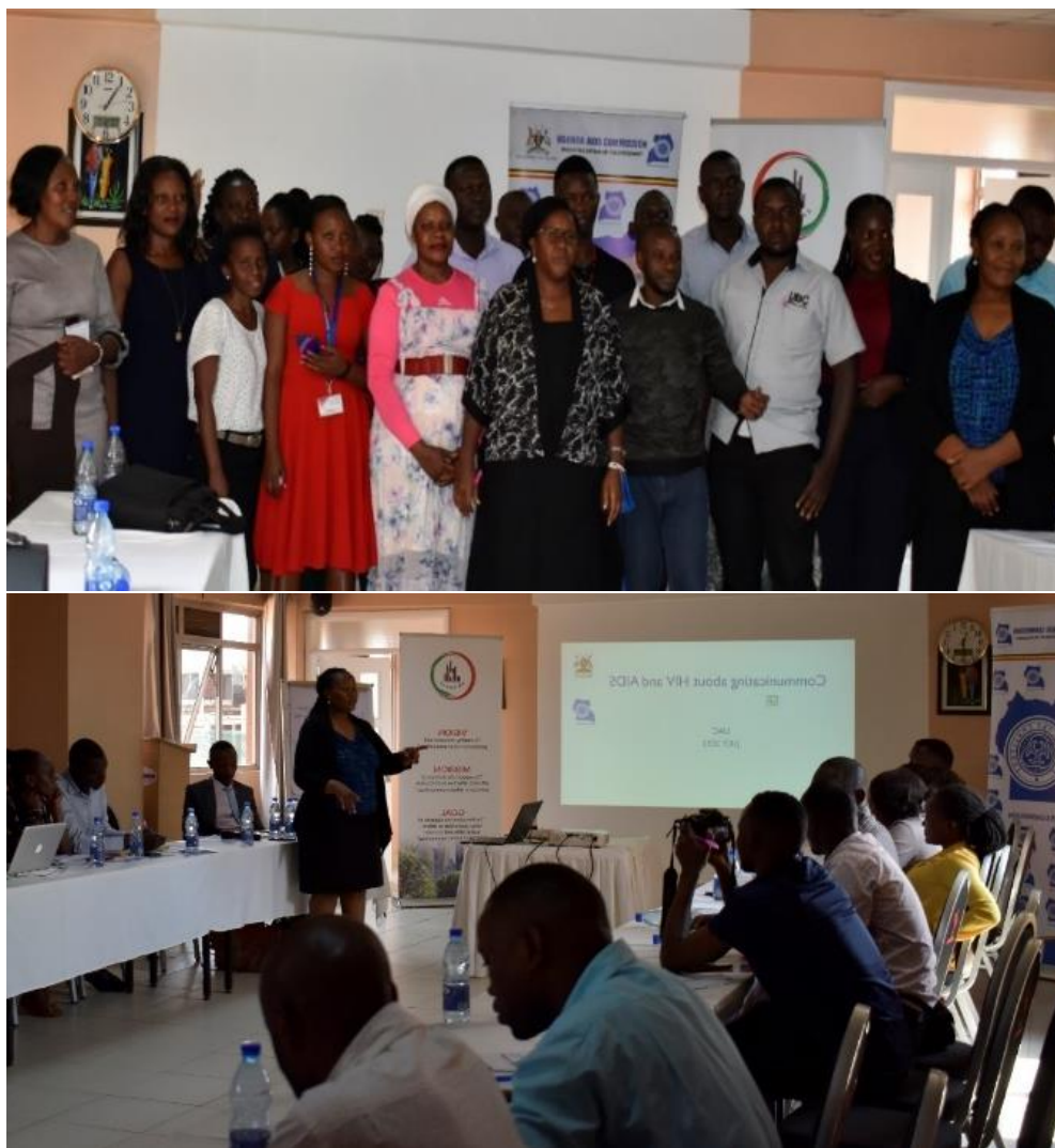
AMICAALL and UAC meeting with media personalities /Journalists on HIV situation and the rationale for the new communication approach at Eureka Palace Hotel