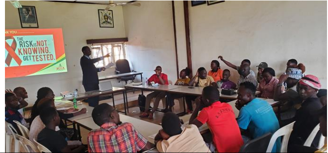
The DMO of Rubaga Division Facilitated the Youth dialogue