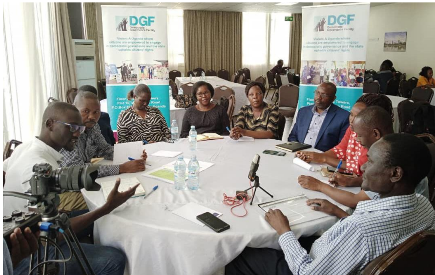
A session on documentation of best practices

AMICAALL participated in the close out meetings by DGF and implemented the close out plan from October to December 31 st , 2022. The activities included End of project assessment, reporting, End of project evaluation and asset verification. DGF organized trainings on cross cutting issues and documentation of best practices which the Ag. Country Director and Institutional Development Manager attended.