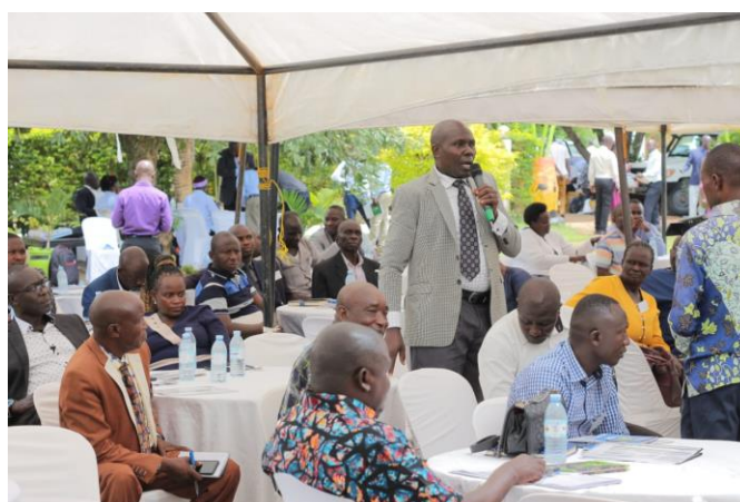
The Urban Leaders' forum and General Assembly proceedings