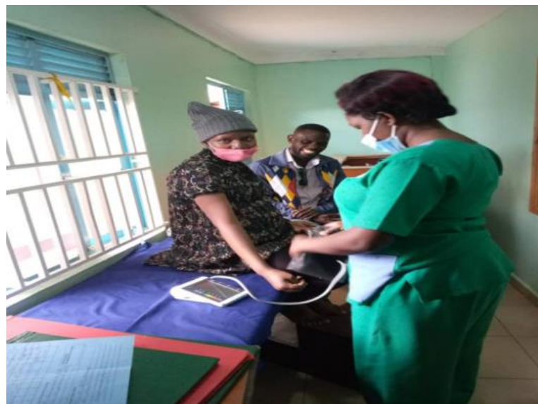
A couple attending antenatal at Malcolm