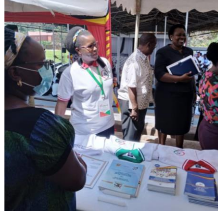
Minister of Kampala and other guests inspecting the AMICAAL stall at the Canldight memorial exhibition

UAC further engaged AMICAALL in post Candle Light memorial activities