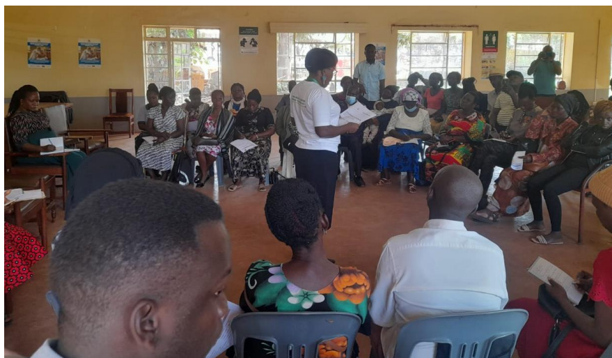
AMICAALL staff facilitating the sensitization meeting in Nakawa.