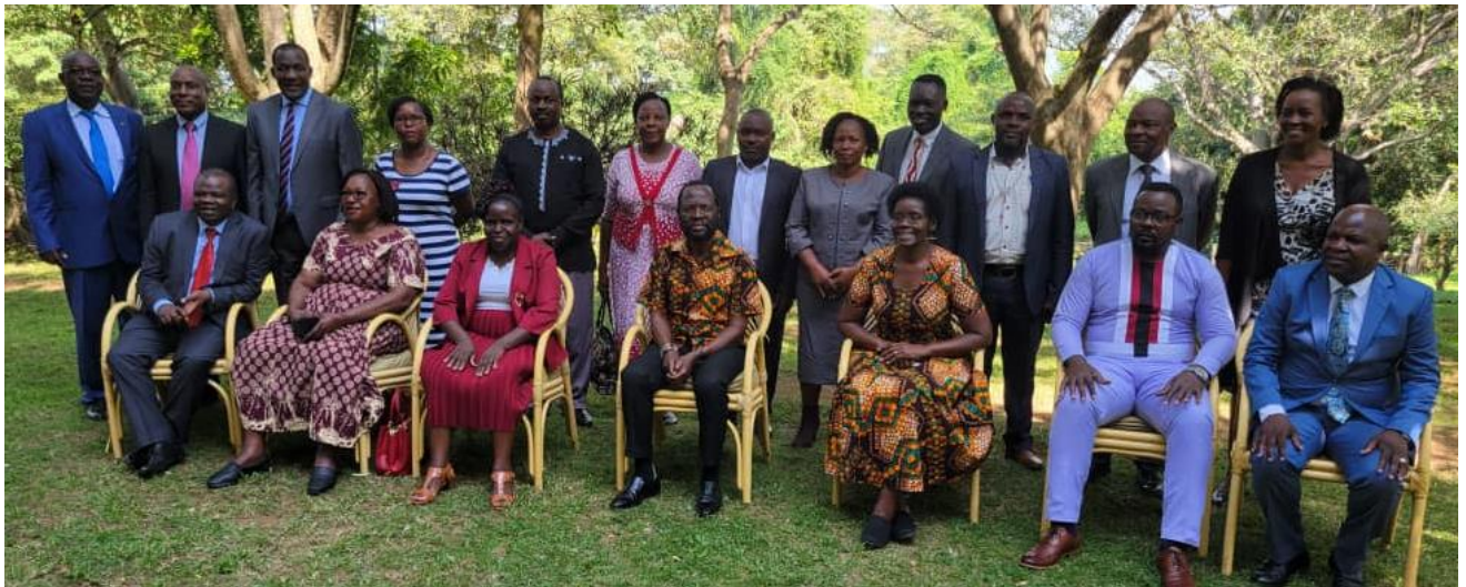
The Alliance Executive Council in Kisumu City with the hosts

The mayors resolved to implement among others the following recommendations in their respective Urban Authorities: prioritize purchase of land for parks and future development in their budgets, meet and plan for the urban authorities with the landlords, gazette more markets to reduce street vending, work with lower councils on bulungi bwansi activities and green Urban Authorities by planting trees on a monthly basis, establish Natural Resources Committees, develop WASH policies and sponsorship activities, improve visibility and branding. On resource mobilization, all revenue should be automated, put in place revenue boards to enhance mobilization and to improve and increase partnerships and networks. The visit was crowned with the signing of the Declaration of Commitment by Uganda visiting Mayors.