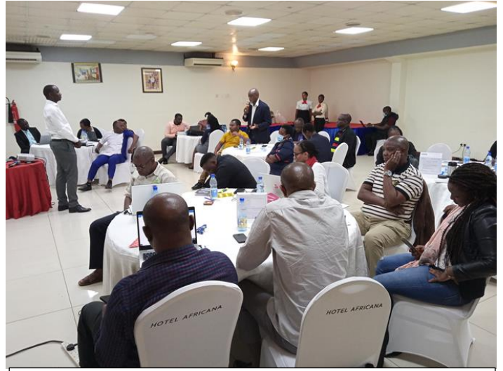
Debriefing the delegates after the Busia field visit

AMICAALL in partnership with MOH and UNFPA carried out activities including Validation of the National Condom and Costed Implementation Plan, Condom Advocacy Plan Training, Harmonizing condom training materials, validation of Condom Training Materials and costed monitoring and evaluation plans. The activities were attended by about 400 participants and were facilitated by consultants knowledgeable in the areas. The participants included AMICAALL staff, MOH staff, CSOs – PACE, AIC, FHI.