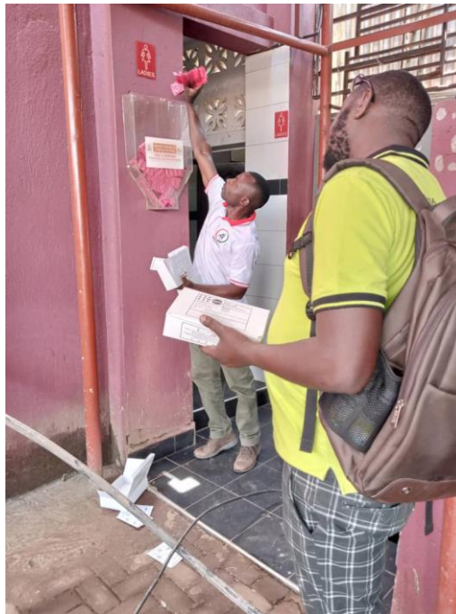
AMICAALL staff refilling dispensers at a Timeless Bar Kulya Kunywa in Nansana MC