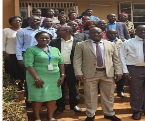
The Mayor of Nakawa Division (cream suit) with DAC members and the Nakawa DHT, UAC and AMICAALL staff.