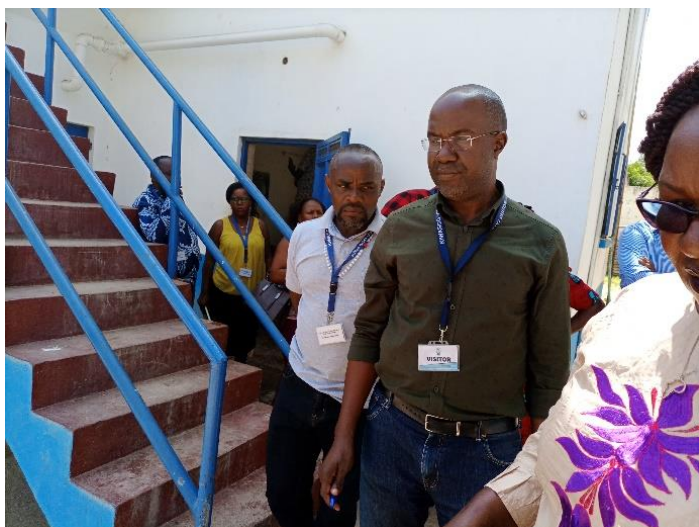
AMICAALL Mayors signed a declaration and committed to implement the lessons